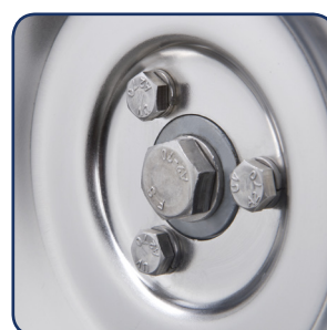
Locking screw for the hose installation