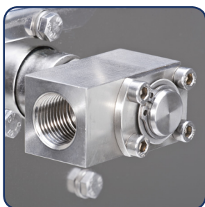
Angled swivel WDTH24/304