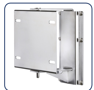
Wall swivel bracket SKW see page 42