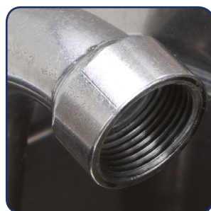
Pipe elbow 1"