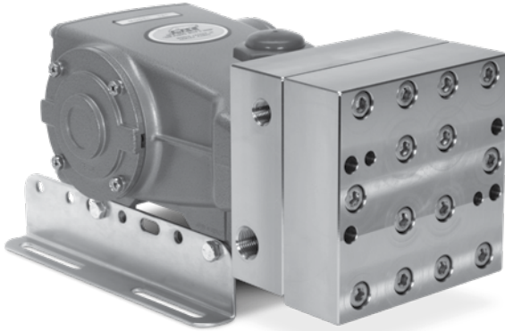
Model 781 Shown (Mounting rails sold separately)